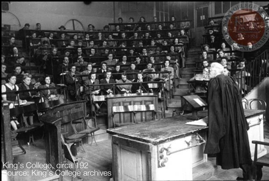
King's College, circa 1920