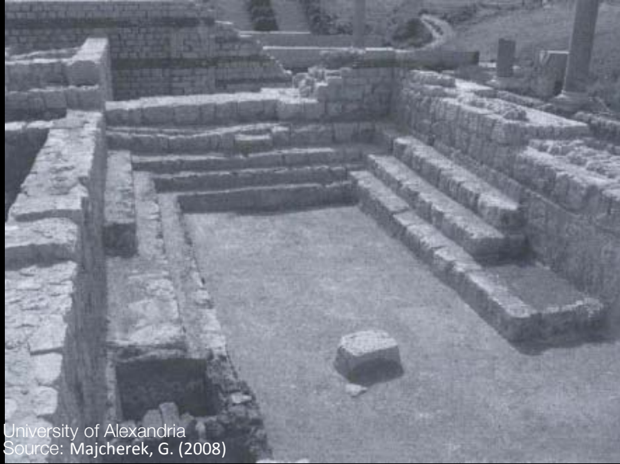
University of Alexandria