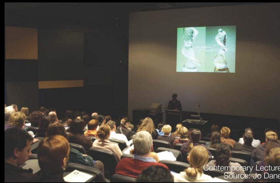
Contemporary Lecture