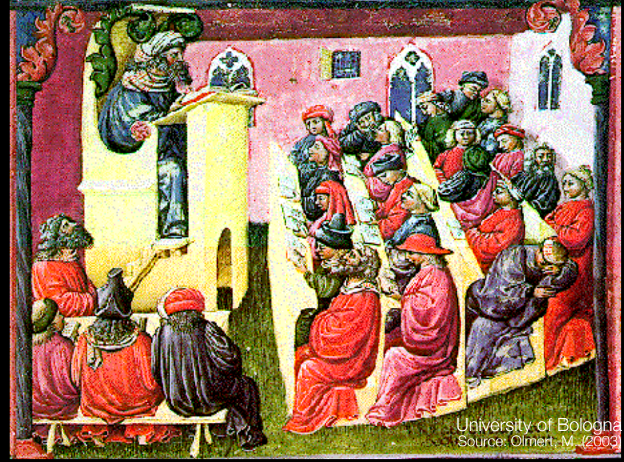
University of Bologna